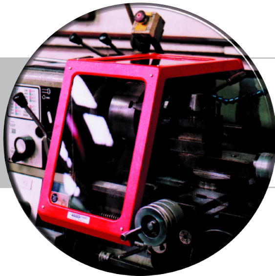
Model - L6, L12 & L18