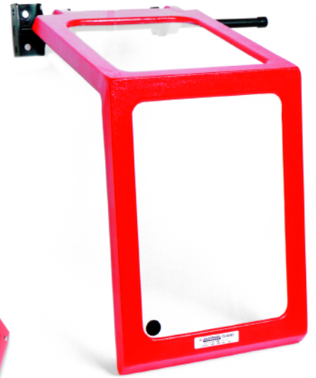
L12 & L18